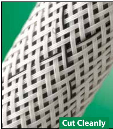
Cut Cleanly Hot Knife